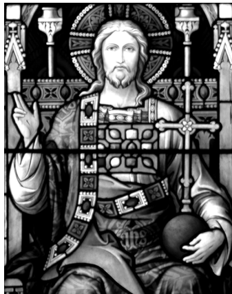
Image from the Cathedral's 'Te Deum' window

"The one who sits on the throne says: Behold, I make all things new. Alleluia!" (Rev. 21:5)