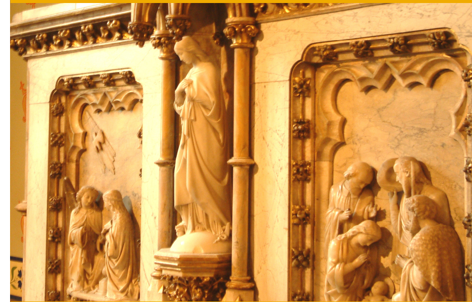
Altarpiece: Lady Chapel Left: The Annunciation; Centre: Immaculate Conception; Right: The Nativity